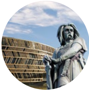
→ ALISE-SAINTE-REINE Museoparc in Alésia