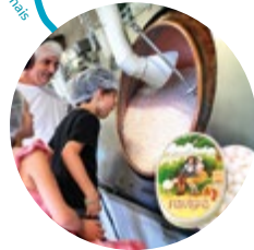
← Fine candies made in FLAVIGNY