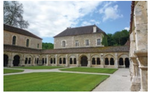
→ FONTENAY - Abbey