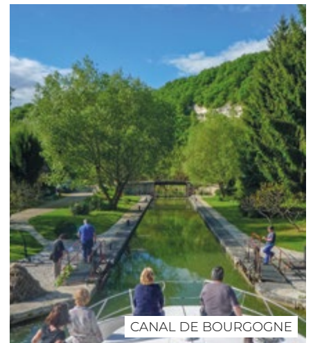
CANAL DE BOURGOGNE

The area is excellent for fishing with many species of fish populating the rivers including pike, carp, perch, bream and many more. Climbers can test their skills and practice climbing on the famous rocks at Saussois while wine lovers can visit cellars and prestigious vineyards (Châblis, Irancy, Crémant de Bourgogne...)