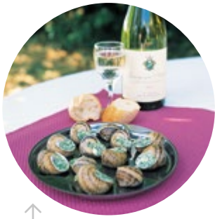
↑ Delicious local foods