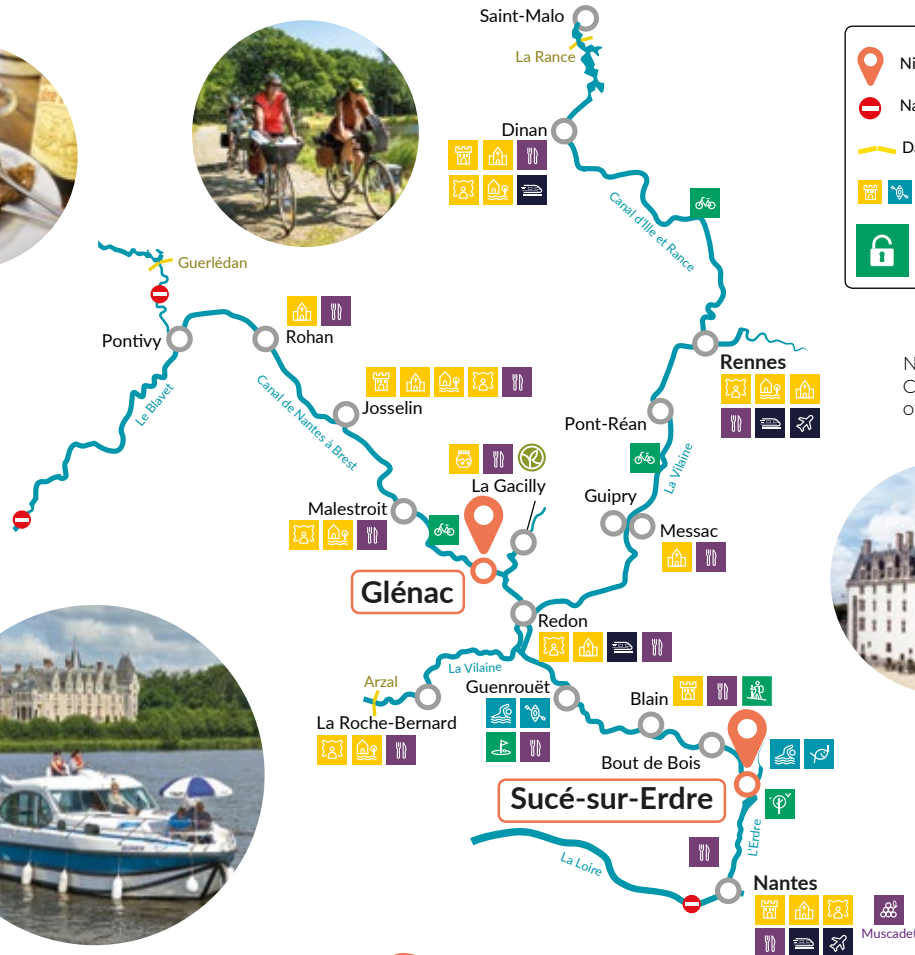
NANTES Castle of the Dukes of Brittany