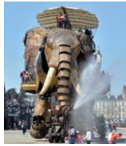
→ NANTES "Machines de l'île"