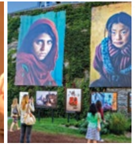
→ LA GACILLY Photo festival