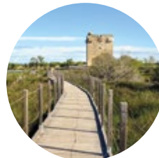
AIGUES-MORTES The Carbonnière Tower