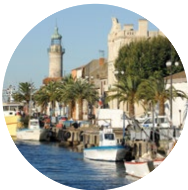
LE GRAU DU ROI