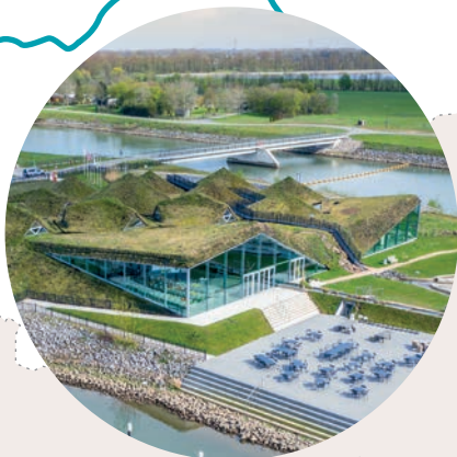
BIESBOSCH National park museum