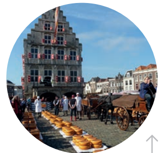
GOUDA - Traditional cheese market