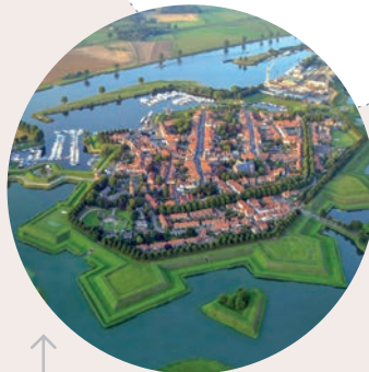
HEUSDEN Fortified city