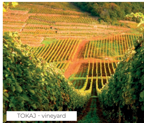
TOKAJ - vineyard

The other available itineraries from Tokaj are a cruise on the Upper Tisza to the north towards Tiszabercel and then to Dombrád, or in the other direction south through pretty countryside and cruising until the hydroelectric power station of Tiszalök before returning to Tokaj.