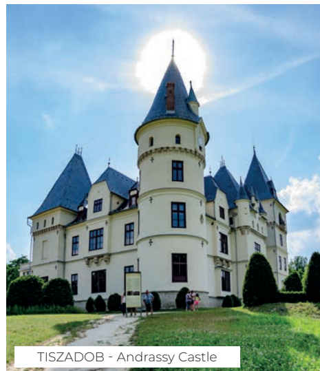
TISZADOB - Andrassy Castle

A cruise from Kisköre sees you switch between navigating on lakes and rivers – with stop offs at Abádszalók and Tiszafüred for swimming, fishing or dinner in the evening in a local restaurant to discover Hungarian cuisine. Sailing upstream on the Tisza River takes you to Tiszacsege, where the famous fish restaurant "Halászcserda" awaits you. Continue your cruise to Tiszalök, where you'll find the impressive hydroelectric power station which can be visited. On the return journey, stop at Andrassy Castle in Tiszadob, then on to Lake Tisza and then to Poroszló and the 'Ecocentre' with its giant aquarium – the perfect family visitor attraction. Nature lovers should also explore the Hortobágy National Park where you'll also find the famous Hungarian "Puszta" (the largest grassland plain in Central Europe), a UNESCO World Heritage Site.